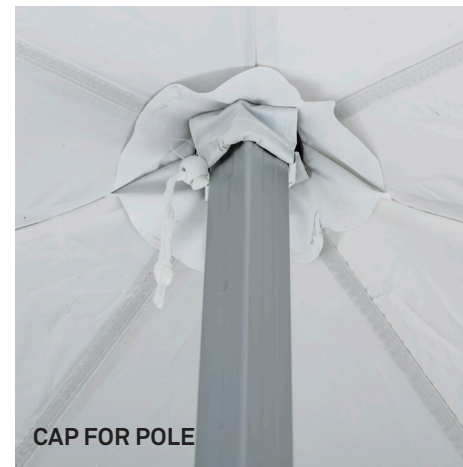
CAP FOR POLE