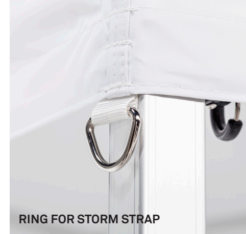
RING FOR STORM STRAP