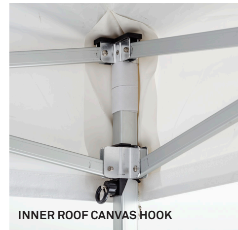
INNER ROOF CANVAS HOOK